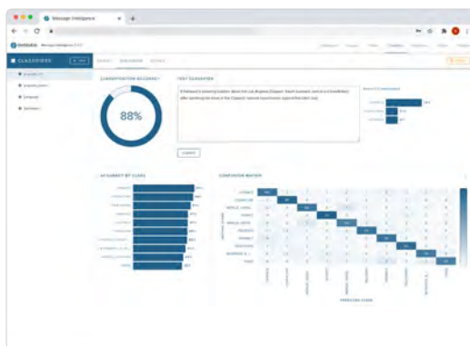
Classifier Evaluation Results

Message Intelligence can also be trained to extract key information from messages and their attached documents. A user-friendly tool allows subject matter experts to build models that identify key extraction targets from within unstructured text. These extraction models can be quickly built with a minimal amount of training data.