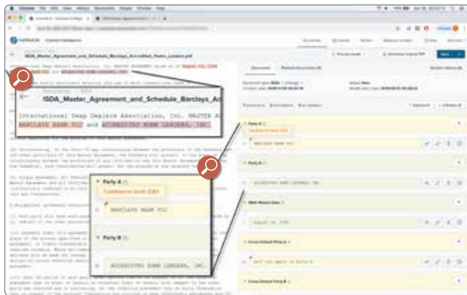
Extraction results are highlighted within the document on the left, and easy to review and confirm with a click-and-go interface on the right

With the new interface, SMEs control the whole training and extraction process and can adapt it to their needs